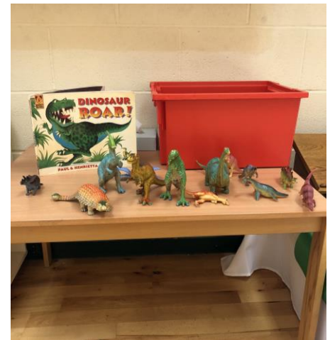
Dinosaurs used to help inspire children during KS1 dance.