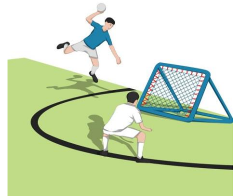
Class 4 explored Tchoukball!

We finished off the term with a Y3/4 Netball game against Grewelthorpe. The children played the game in fantastic spirit!